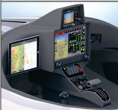
Central panel and console with GARMIN G3X/G5