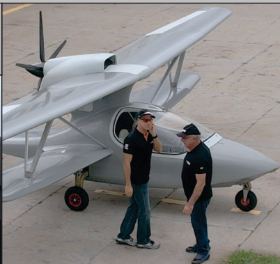
New canopy design